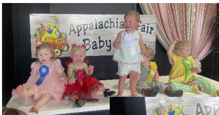
2024 / 13-24 Month Old Girls / Best Developed & Prettiest