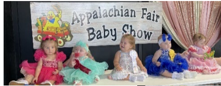
2024 / 6-12 Month Old Girls / Best Developed & Prettiest