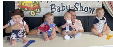
2024 / 6-12 Month Old Boys / Best Developed & Most Handsome