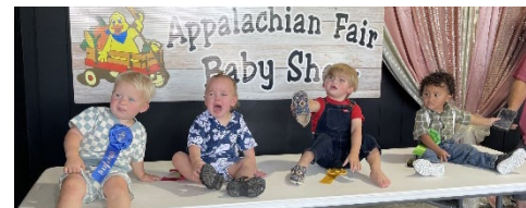
2024 / 13-24 Month Old Boys / Best Developed & Most Handsome