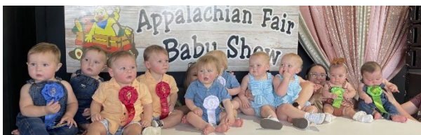
2024 / 6-24 Month Old Twins