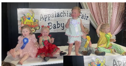
2024 / 13-24 Month Old Girls / Best Developed & Prettiest