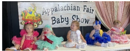
2024 / 6-12 Month Old Girls / Best Developed & Prettiest