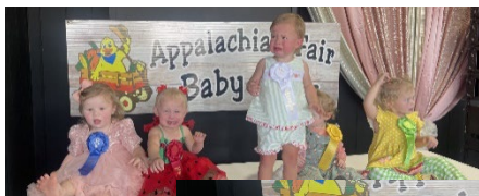
2024 / 13-24 Month Old Girls / Best Developed & Prettiest