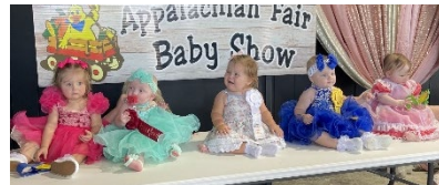
2024 / 6-12 Month Old Girls / Best Developed & Prettiest