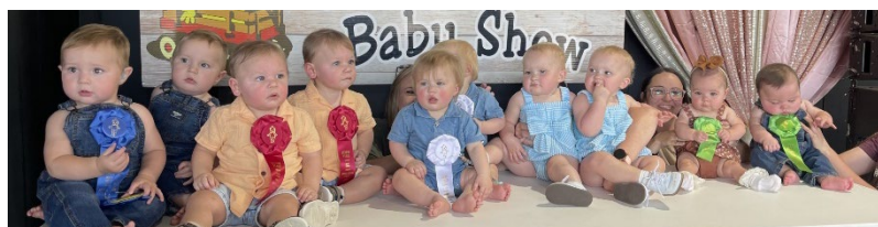
2024 / 6-24 Month Old Twins