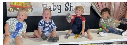
2024 / 13-24 Month Old Boys / Best Developed & Most Handsome