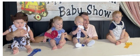
2024 / 6-12 Month Old Boys / Best Developed & Most Handsome